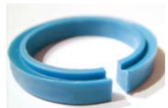
A molded gap in each ring transmits the hydrostatic head along the entire length of the plunger instead of concentrating all of the pressure on the top and bottom ring.

Field-tested under the most adverse well conditions, DARCOVA's PA rings have proven themselves time and again, becoming the "ring of choice" of North American producers.